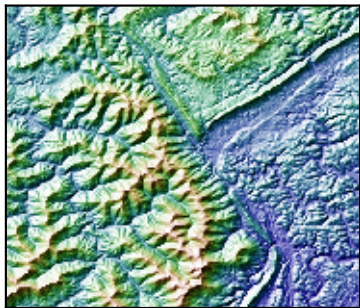
Blend Mode: "hsv" (default)